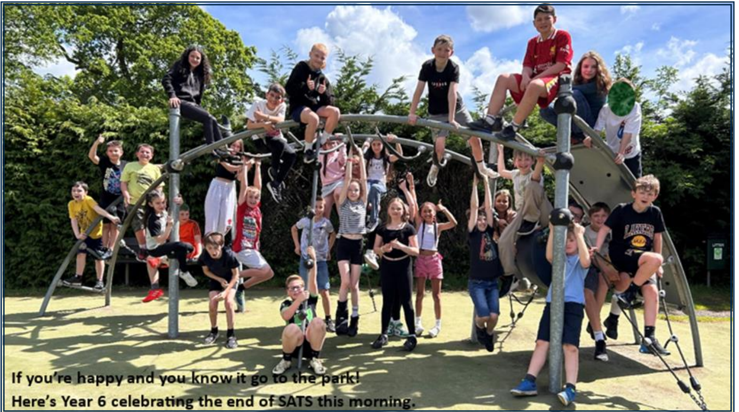
If you're happy and you know it go to the park! Here's Year 6 celebrating the end of SATS this morning.