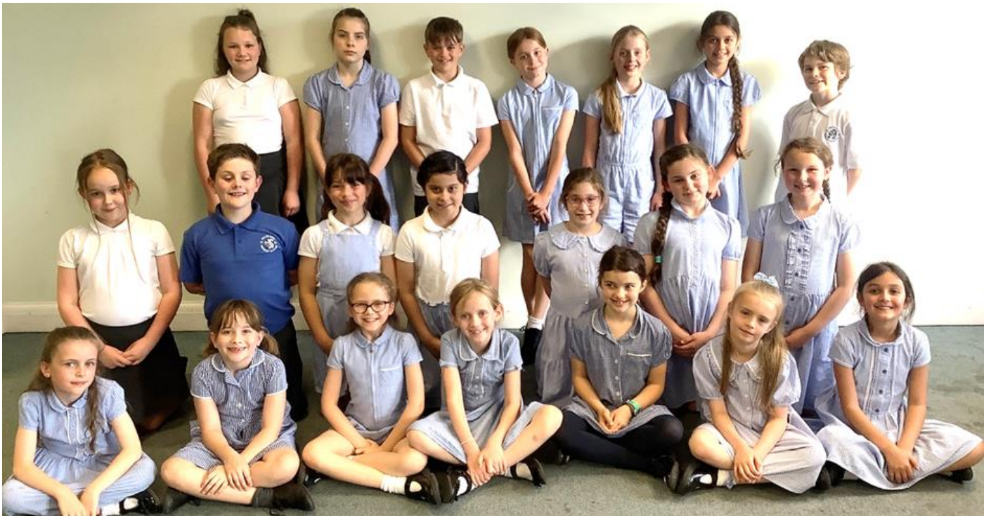
A pre-show choir getting ready to sing their hearts out under some very hot lights at Leatherhead Theatre!